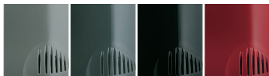
GREY DARK GREY BLACK PURPLE